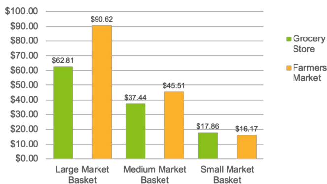
Figure 1: Pricing Comparison by Basket for Grocery Stores and Farmers' Markets

For all the farmers' markets, as basket size decreased, the premiums over the surrounding grocery stores also decreased, as the small basket prices were not only comparable across locations, but nearly equal to surrounding grocery stores. Hence, consumers who purchase a few things as the farmers' market will find comparable pricing, but larger purchases tend to lead to increased spending at the market. Efforts to increase both the number of products and amount purchased by