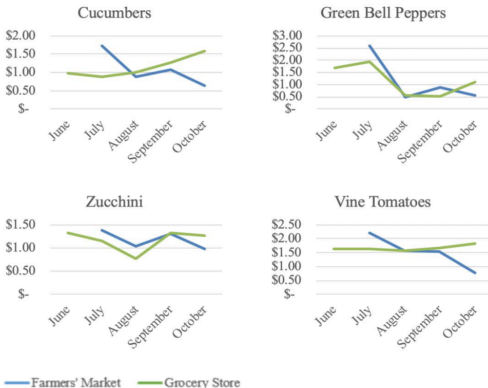
Figure 3. Produce Variety Monthly Price Variations ($/lb)

The seasonal effects at farmers' markets and grocery stores for each produce item in the medium market basket were examined. Figure 3 shows the results of the seasonality comparisons. Of the ten produce items in the medium market basket, four items have significant price discounts at the farmers' market and significant price premiums at the grocery store as the growing season progresses (late summer or early fall). Generally, grocery stores do not have the seasonality effects that farmers' markets do; there is also less variability in pricing overall. Also, the availability of produce items is more consistent at the grocery store than the farmers' market.