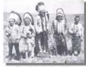
Warm Springs Leaders, 1938